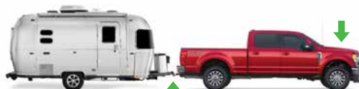
With Weight Distribution Hitch