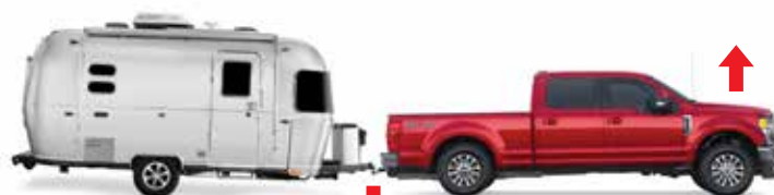
Without Weight Distribution Hitch