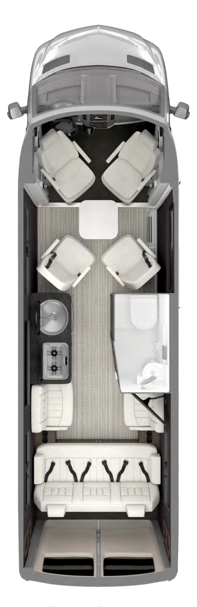
Interstate Lounge 4x4