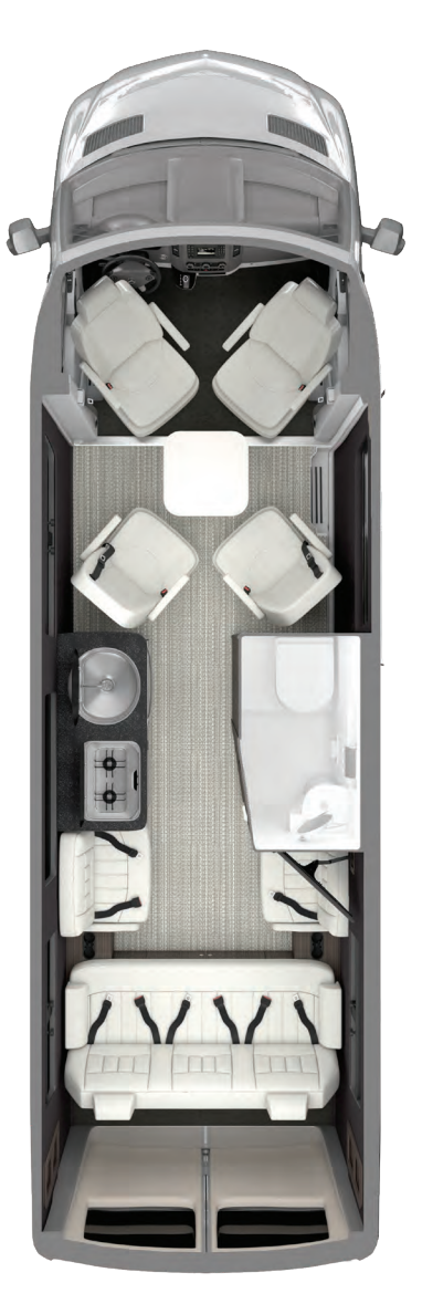
Interstate Lounge 4x2

In the Interstate Lounge, the fun doesn't have to wait to begin until you arrive at your destination, the fun begins the moment you step inside.