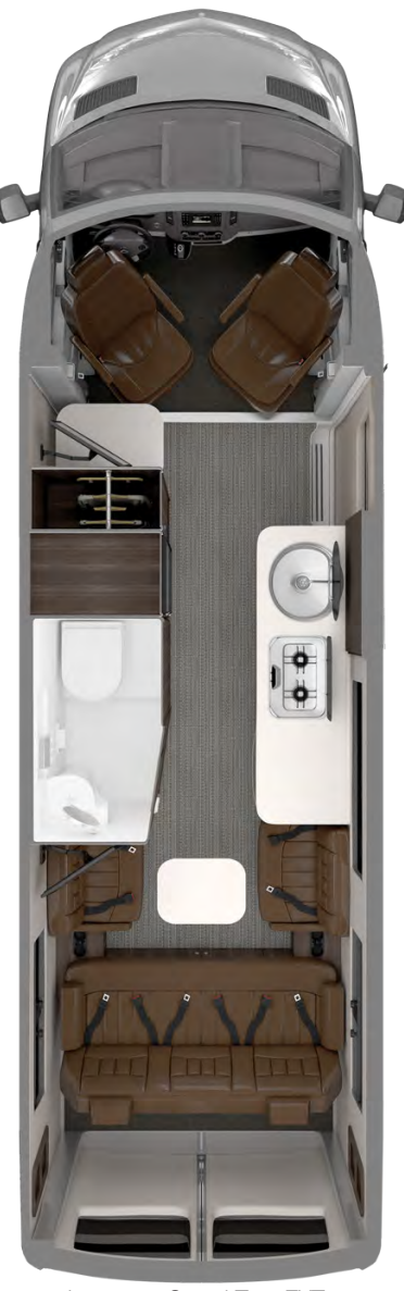
Interstate Grand Tour EXT