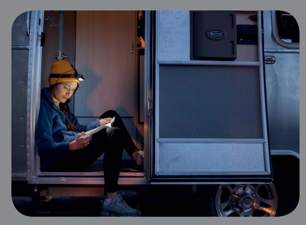
Read under the stars, by the light of the cabin, or a little bit of both.