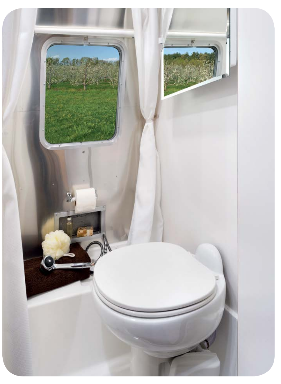
Bathe in natural light in the Sport 16RB lavy. Literally.