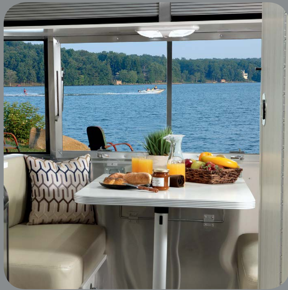
For great meals or game night, the dinette effortlessly converts to a lounging sofa or bed.

From the compact, intelligent essentials of the 16 ft. to the extra amenities and space of the 22 ft., the 2019 Airstream Sport is so well crafted and thought out that it delivers far more features than you'd expect in a trailer this size.