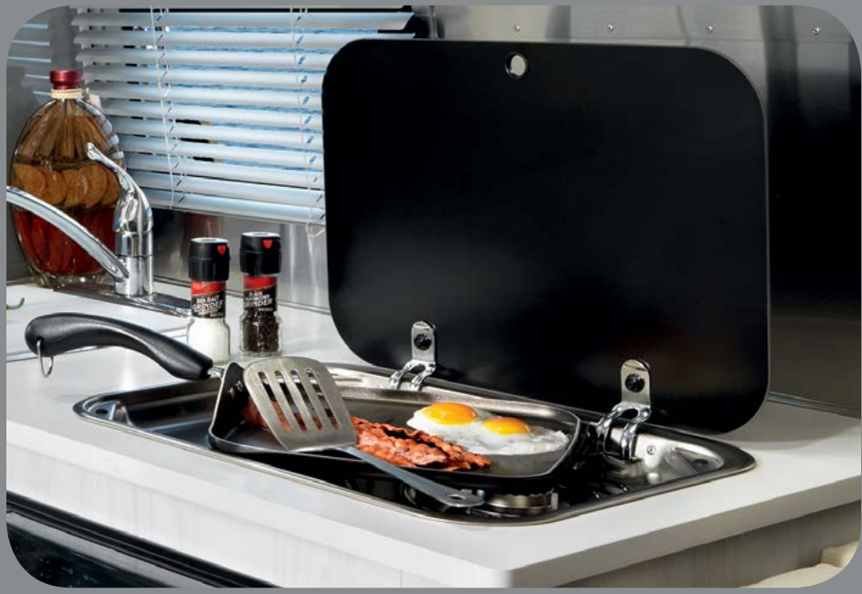
Two burners, infinite possibilities in the Sport's kitchen.