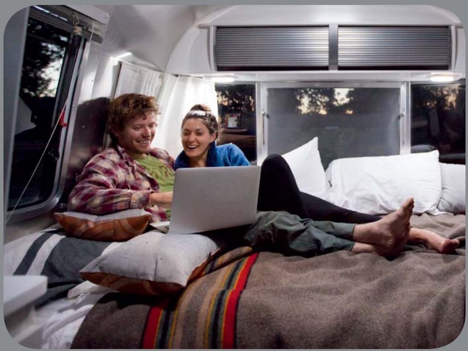
Sleep, watch a movie or relive the day's adventures in the spacious, cozy queen bed.