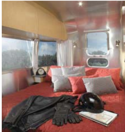
▲ Large Queen Size Bed.

▼ Dining and Galley Area in the PanAmerica