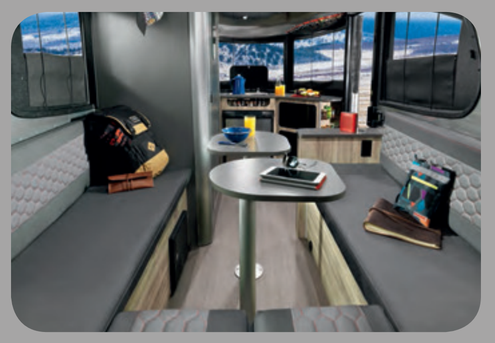
Group seating option – U-lounge seating for 5