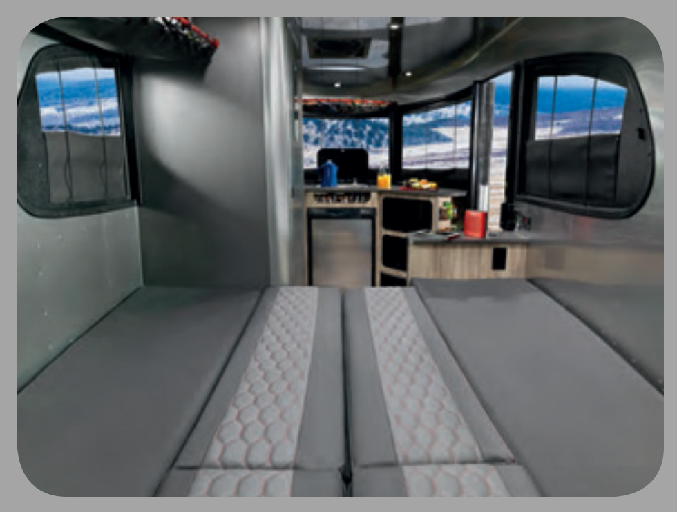
Full bed sleeping option – 76 in. x 76 in.