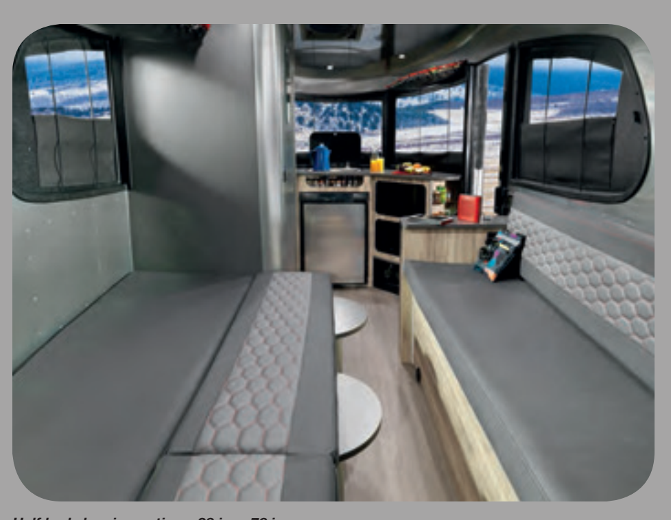
Half bed sleeping option – 38 in. x 76 in.