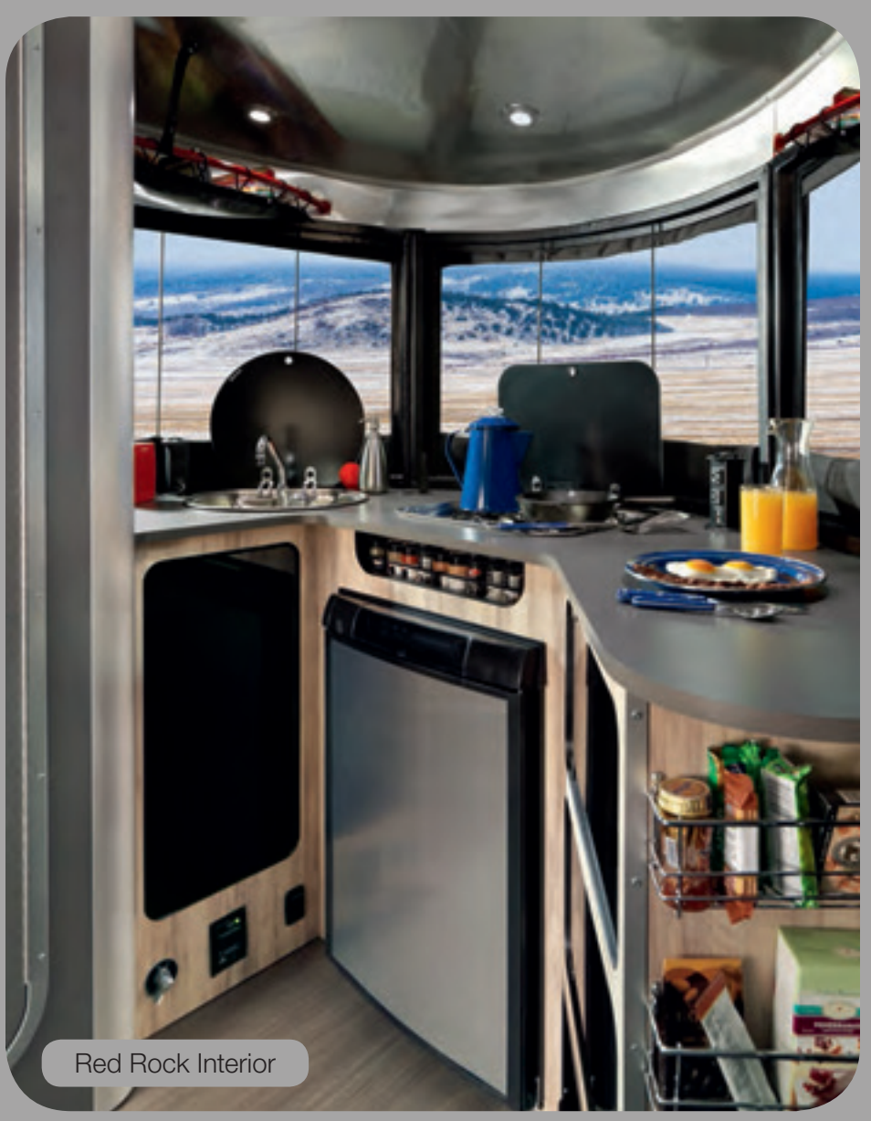
Eggs with bacon and a side of landscape.

The 2018 Airstream Basecamp is a sturdy, hypnotically beautiful escape pod packed with everything you need to live in complete comfort – whether you're off the grid, at a family campground or in a friend's backyard.