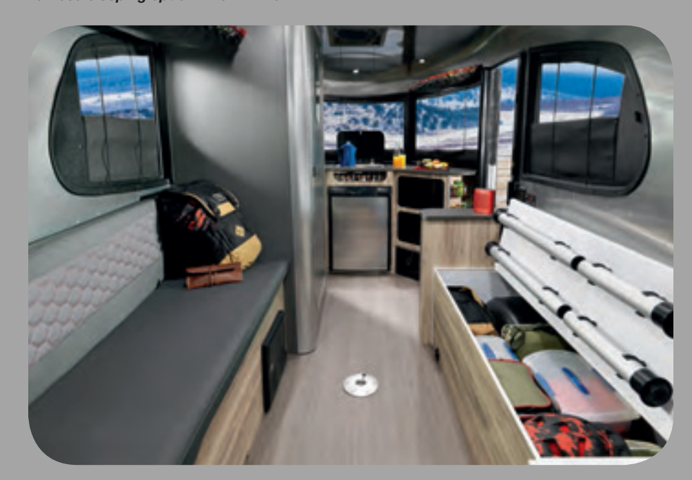
Bench storage - 11.5 cubic feet