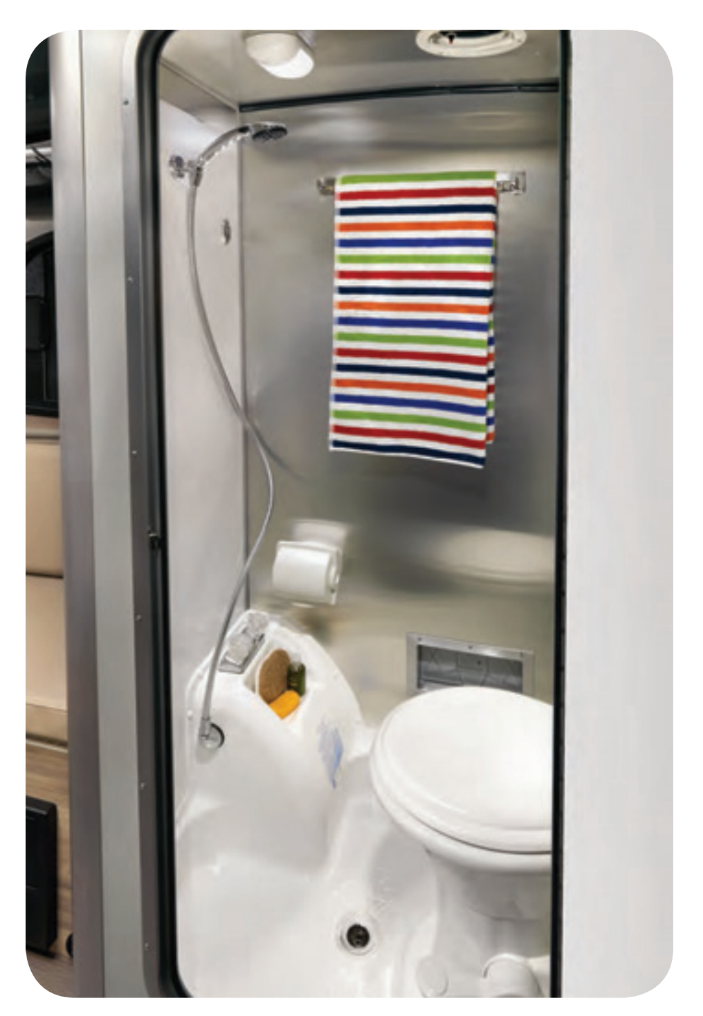
The full wet bath takes the sting (and stink) out of remote adventures.