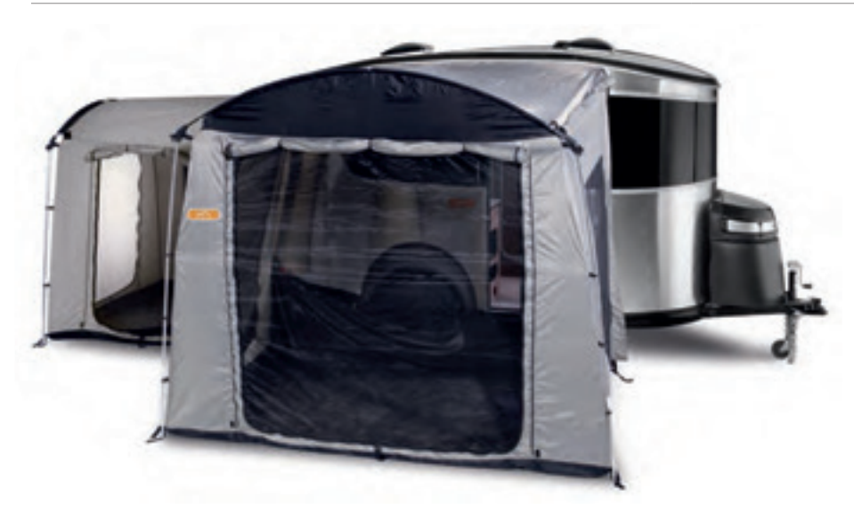
Keep the bugs out and the gear close with optional patio and rear tents.